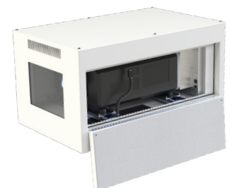
User manuals, 2D and 3D CAD drawings at www.tempest.biz