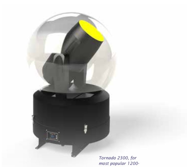
Tornado 2300, for most popular 1200-1700W Luminaires