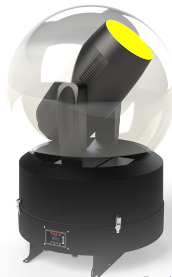
Tornado G4 2300, for most popular 1200-1700W Luminaires