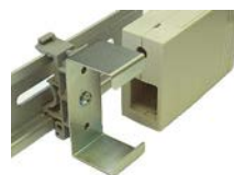
DIN Rail Clip