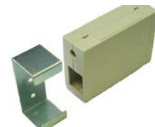
Surface Mount Clip